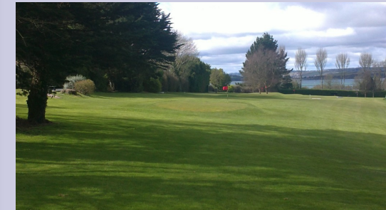
(View Of The First Hole - Corkbeg Pitch And Putt Club)